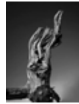
Narinder Sall narinder @narindersall.com

You Talkin' to Me? Photography, traditional 24" x 18" $500