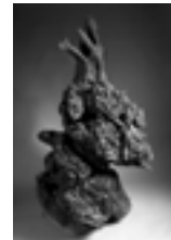
Narinder Sall narinder @narindersall.com

Maybe Something; Maybe Nothing No. 2 Ink on paper 37.5" x 30" $400