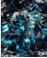
Janice Graham Smith Janicesmith0822 @comcast.net

Water Image Photography, traditional 18" x 24" $220